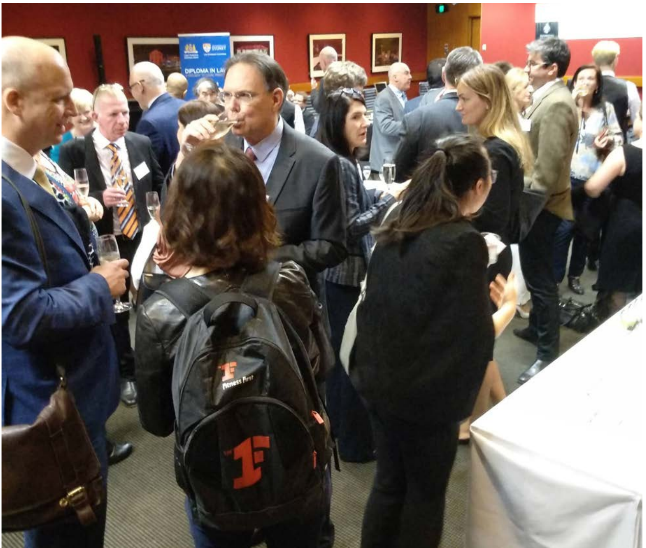
2018 Alumni function at NSW Parliament House.

You can also become part of our alumni community by connecting with us on LinkedIn https://www.linkedin.com/school/lpab-lec-diploma-in-law/