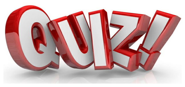
Test your knowledge!

The Central Restrictive Practices Team is relatively new and undergoing change (we have just moved from Strawberry Hills to Parramatta). I am proud of what we have become and what we will become in protecting the vulnerable and to safeguard their human rights.