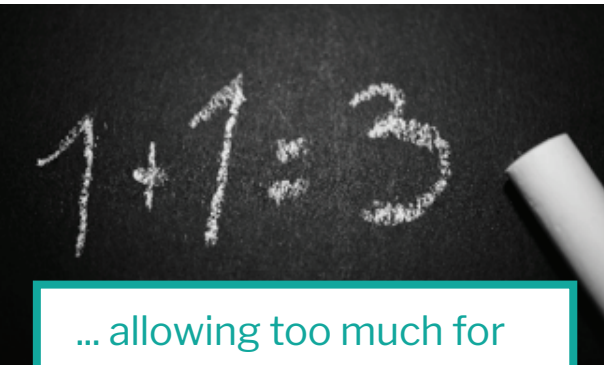
... allowing too much for contingencies may mask a project's viability

be broadly equivalent to the developer's margin used in residual land value modelling but expressed as a dollar value.